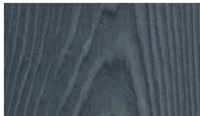
Rustic Slate (458)