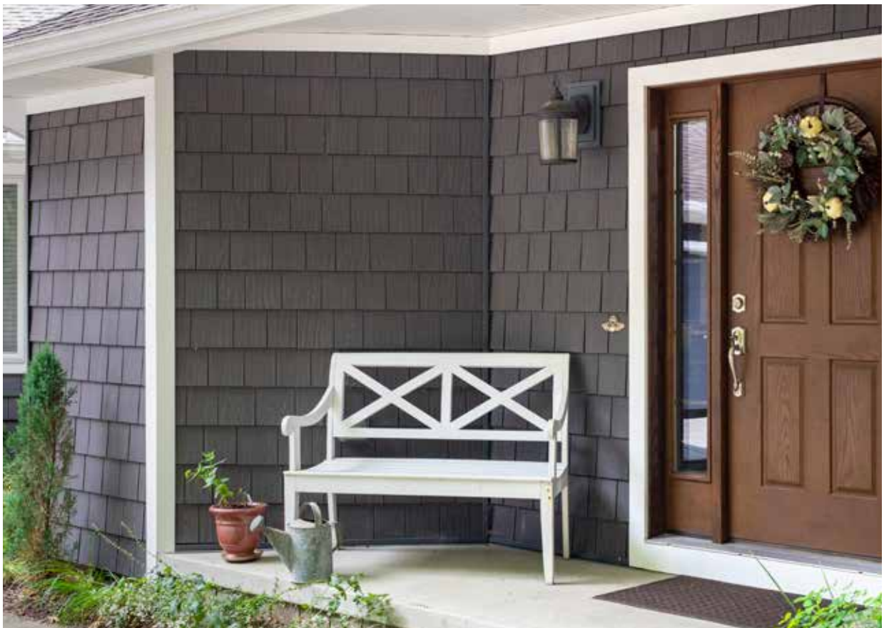
7.5" Grayne | Aged Grey (451)

Foundry's Grayne Shingle Siding perfectly replicates the look of cedar with its undeniable curb appeal and true-to-life, weathered color selection. It features a realistic wood grain that you have to see and touch for yourself to truly appreciate. Grayne Shingle Siding offers more than exceptional curb appeal – it's also easy to install with minimal waste and little maintenance.