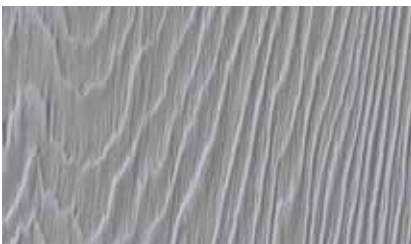
Cape Grey (401)

Foundry's 5" White Cedar color palette incorporates the subtle color gradations and variations in the grain of plain-sawn shingles, giving the striking appearance of true cedar from every angle. Instantly get the look of aged cedar without any of the maintenance that accompanies real wood.