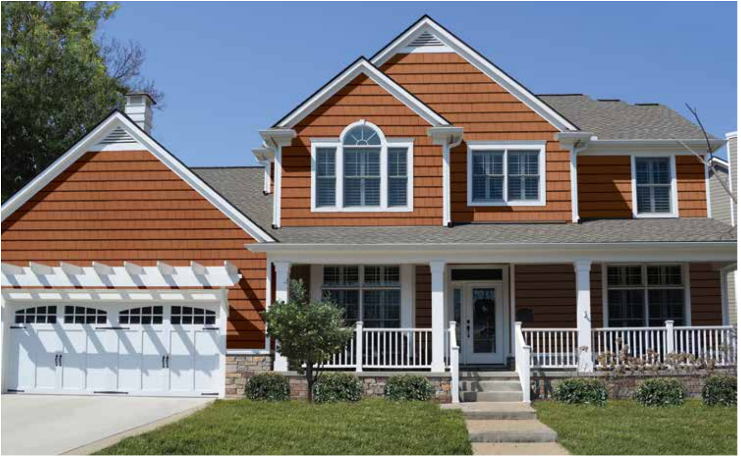
Treated Cedar (453)