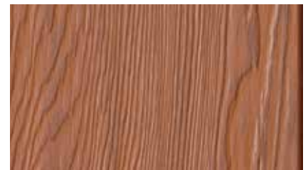
Treated Cedar (453)