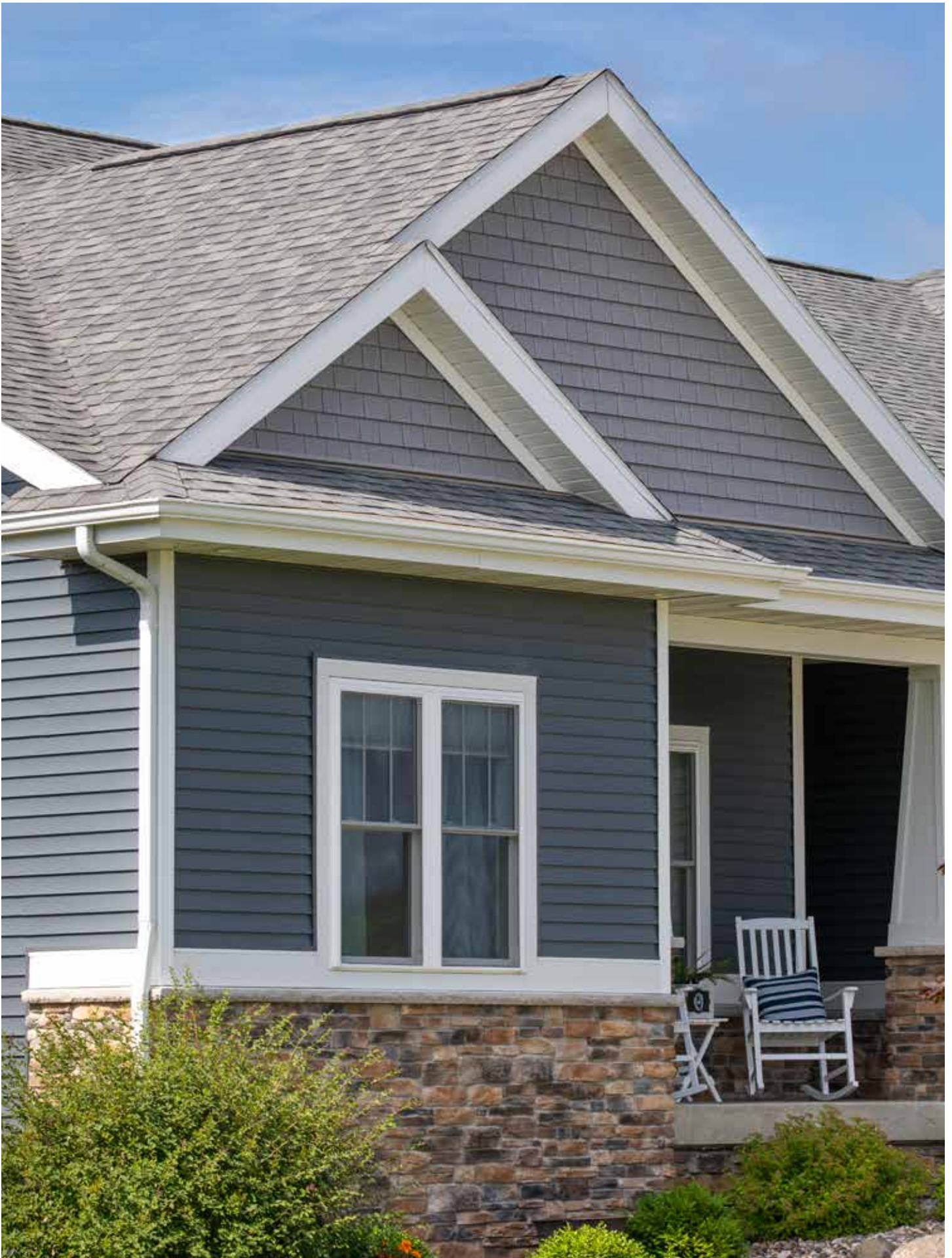
5" Grayne | Cape Grey (401) On the cover, 7.5" Grayne | Aged Grey (451)