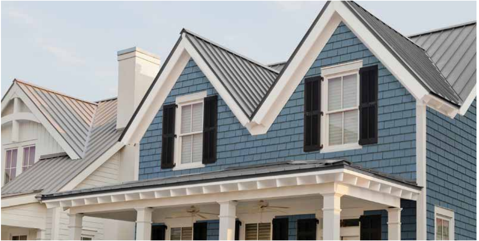
5" Grayne | Lakeside Blue (403)