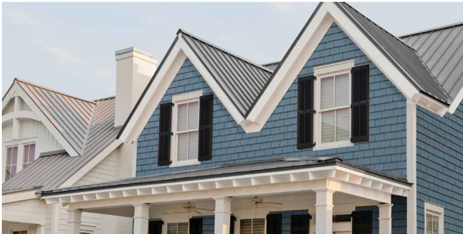
5" Grayne | Lakeside Blue (403)