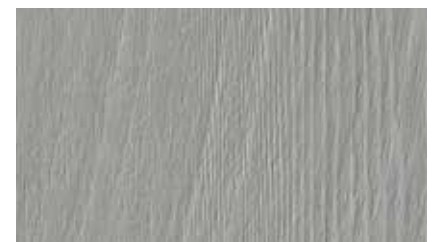
Heritage Grey (455)