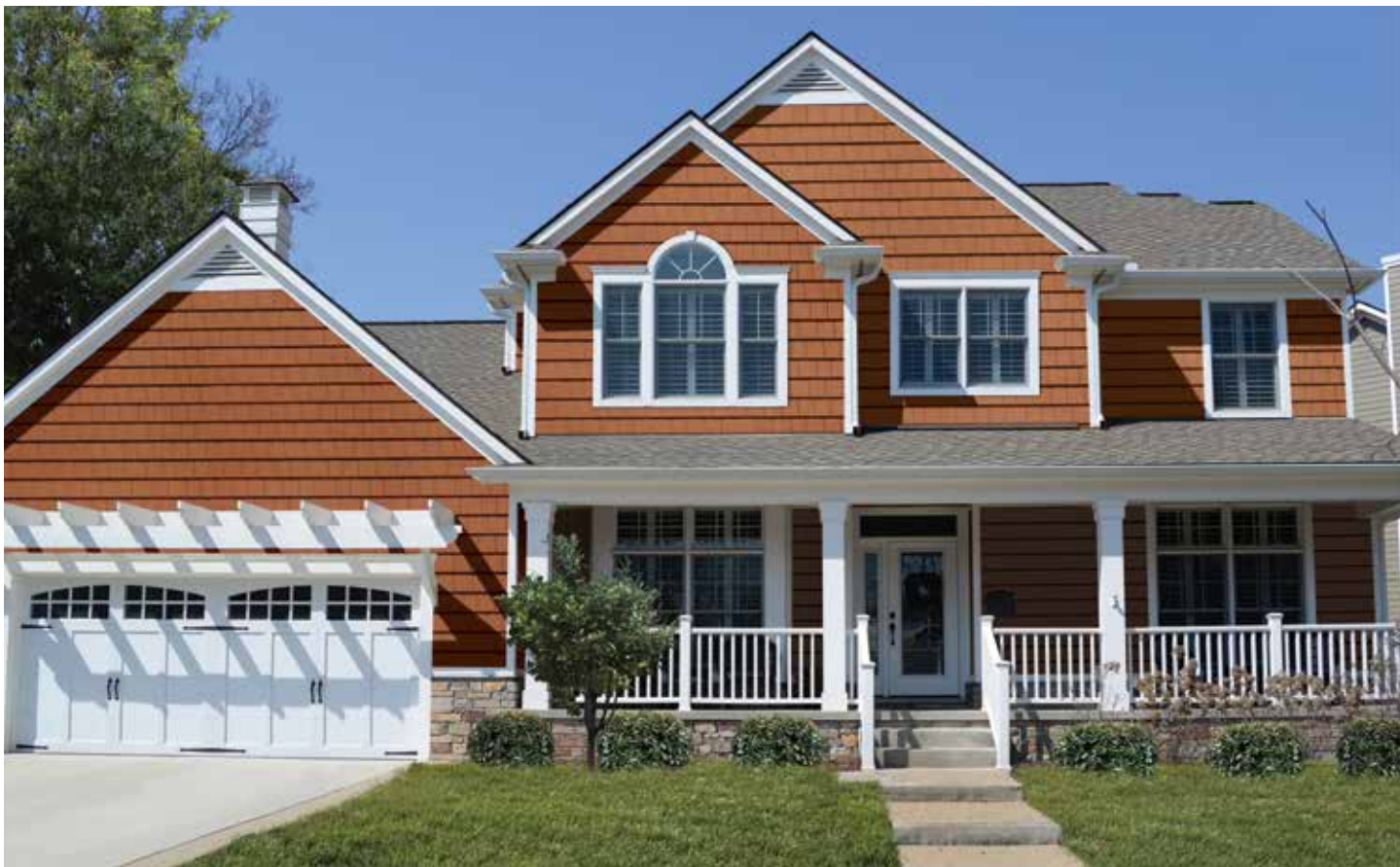
Treated Cedar (453)