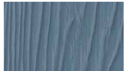
Lakeside Blue (403)