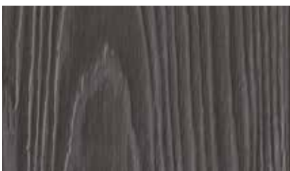
Aged Grey (451)