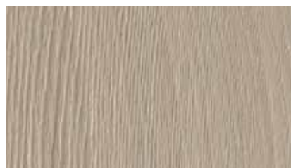
Harvest Shade (456)