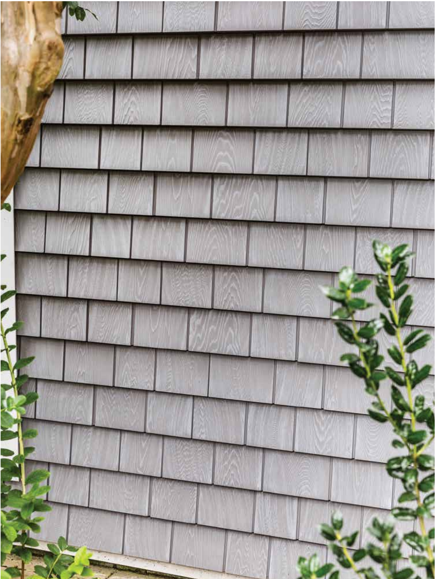
5" Grayne | Cape Grey (401)