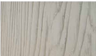
Mountain Ash (457)

What makes natural cedar shingles so striking is the color variance found in the woodgrain. That's why 7.5" Red Cedar offers six warm and welcoming cedar colors that have light and dark points like cedar found in nature. Ranging from stained looks to aged cedar, it's easy to find the perfect match for any project.