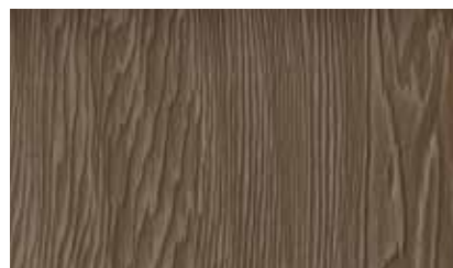
Aspen Brown (405)