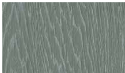
Ridge Moss (404)