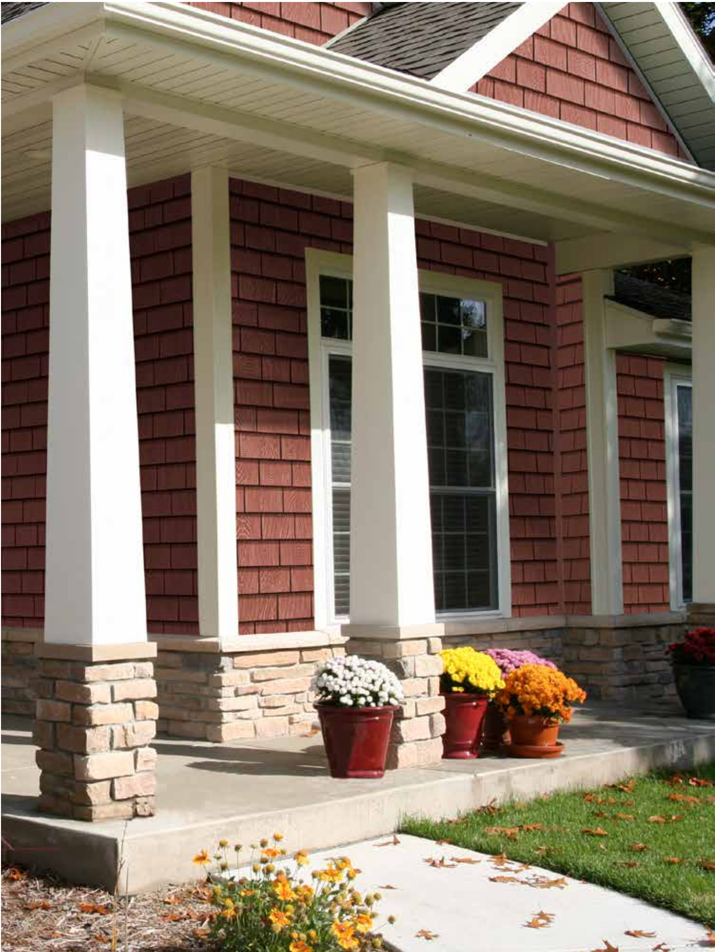
5" Grayne | Homestead Red (406)