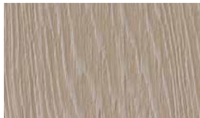
Autumn Shade (402)