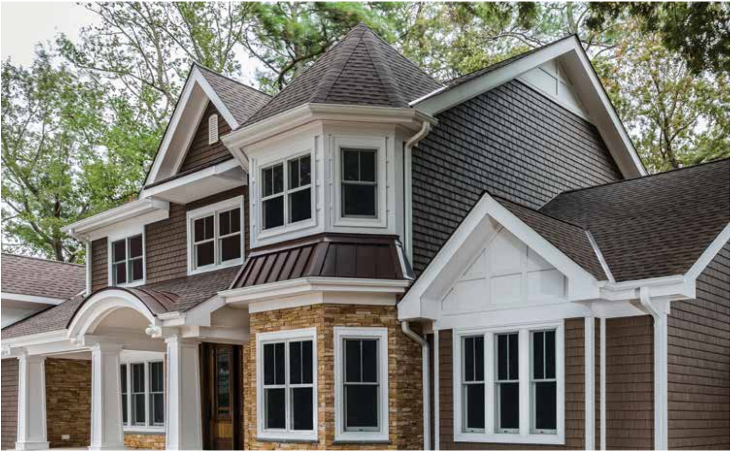
Aspen Brown (405)