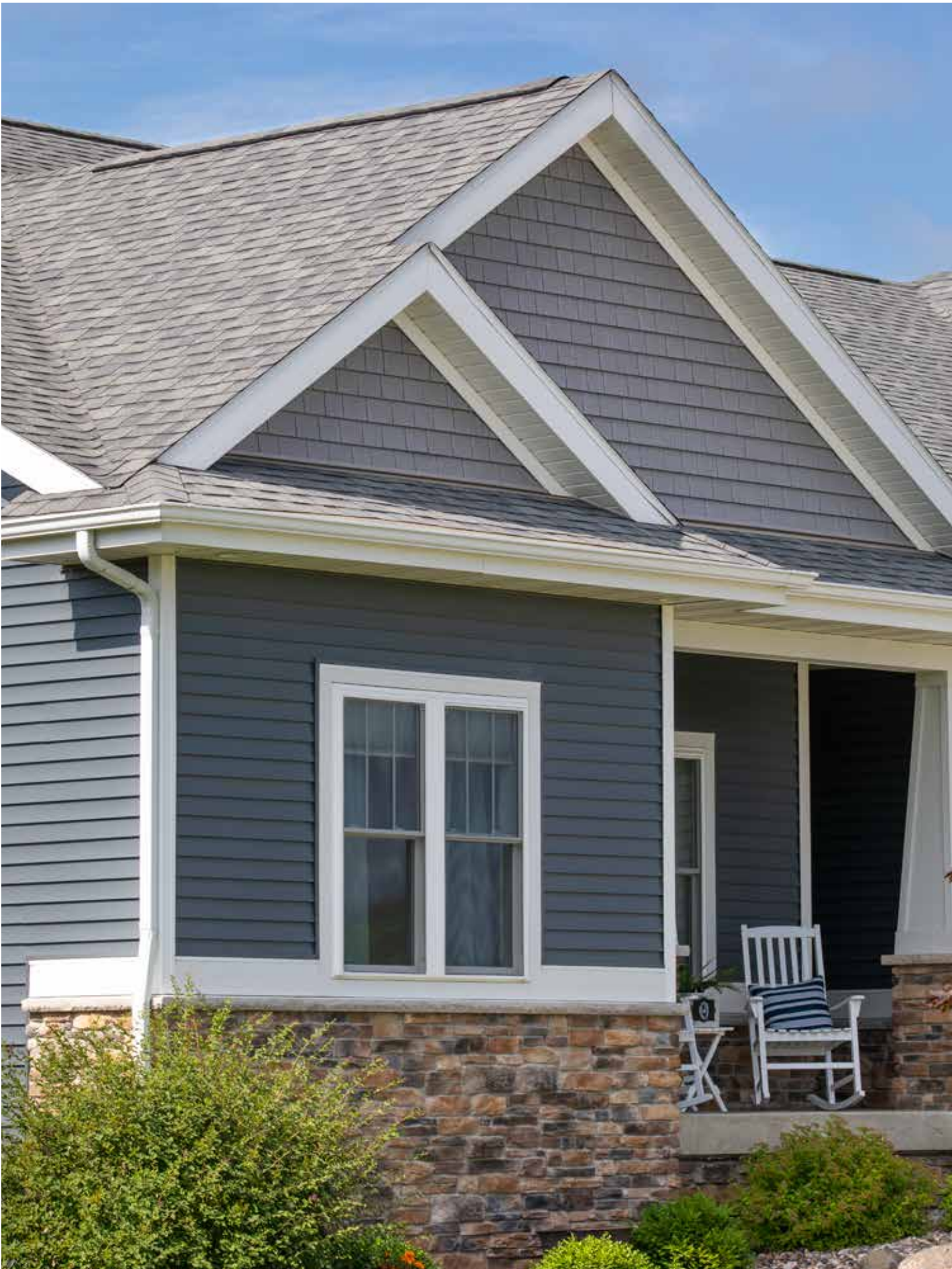
5" Grayne | Cape Grey (401) On the cover, 7.5" Grayne | Aged Grey (451)